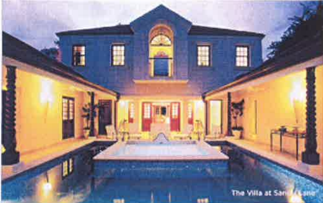
The Villa at Sandy Lane