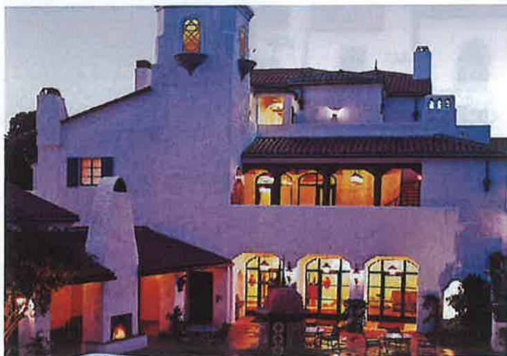
The Ojai Valley Inn's spa courtyard by night.

That mesh of California charm, Spanish furnishings and Moroccan accents extends everywhere, including the resort's 308 deluxe guest rooms, many of which sport fireplaces and private balconies or patios overlooking the golf course and nearby mountains, and all of are appointed with spa amenities and feature resort privileges, from complimentary valet parking to access to fitness classes and the driving range. And if those accommodations don't meet your spatial requirements, there are seventy-five more upscale suites, not including the Spa and Hacienda penthouses.