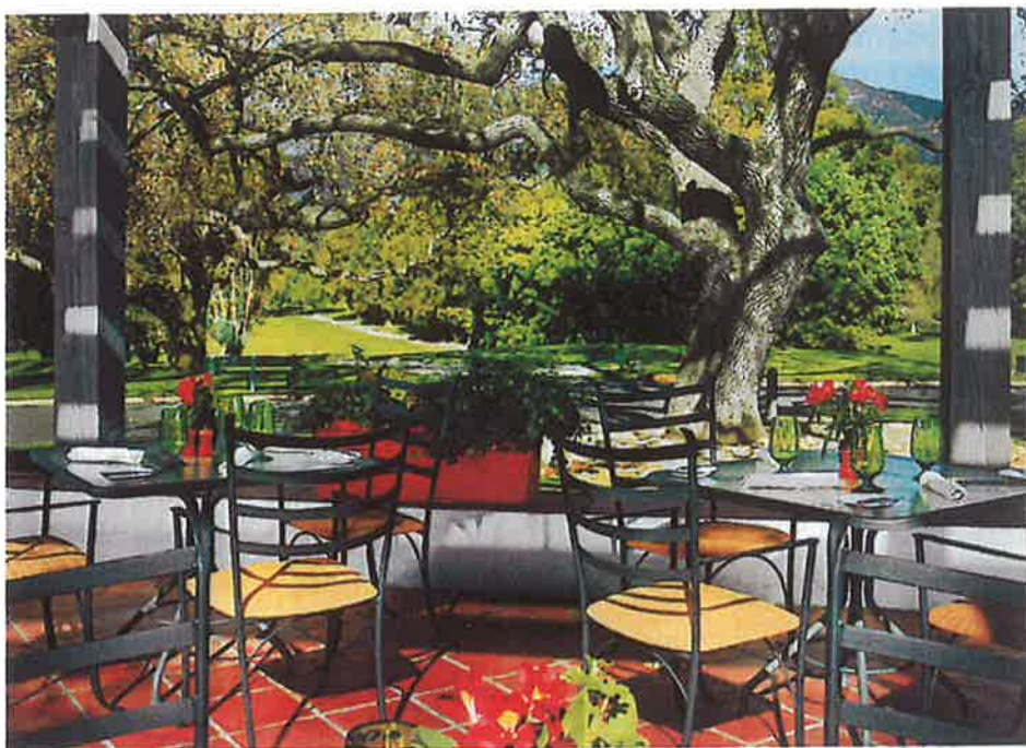
A golf course and mountain backdrop await visitors to the Oak Grill terrace.

We followed the trails into town, where we saw street performers intermingle with friendly, open-minded, laid-back locals encompassing every type of divinity and philosophy you could imagine.