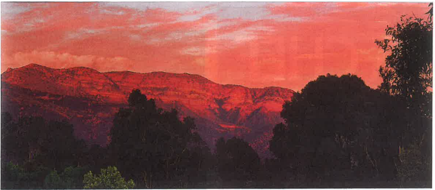
The Topa Topa mountain range is bathed in fiery tones of pink and orange in another signature sunset.

Freckled with gnarly 200-year-old oaks, the heaving Ojai layout was expropriated during WWII by the U.S. military, who used it as a training camp. Some holes were lost in the process.