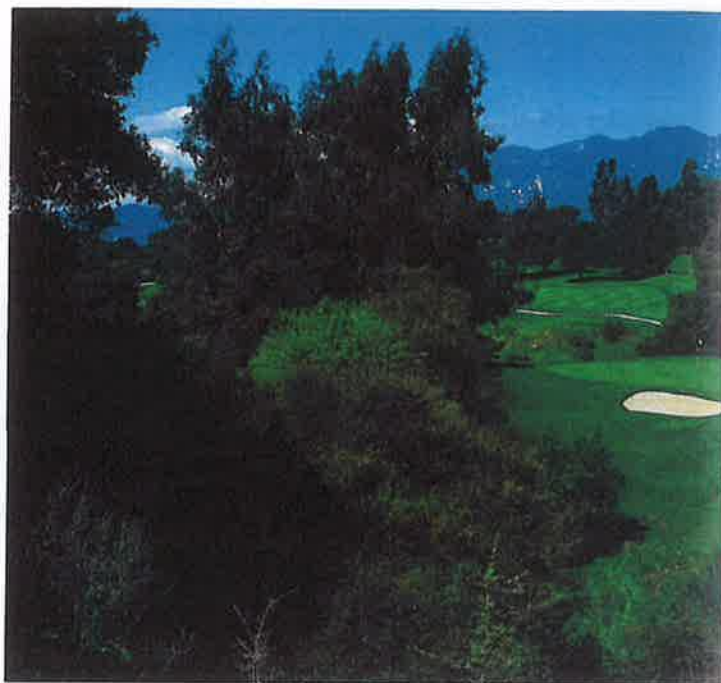
Although just under 6,300 yards, Ojai's elegant 1923 design is well defended.