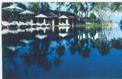
The environment at Six Senses focuses on peaceful relaxation.

best spas, even when they're a long haul away. Hot-stone massage or Mother Yoga? Ayurvedic or Western pampering? Here are some must-visit destination spas.