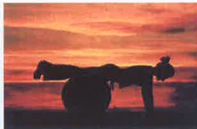
Trip hosts at Pure Kauai keep visitors active.