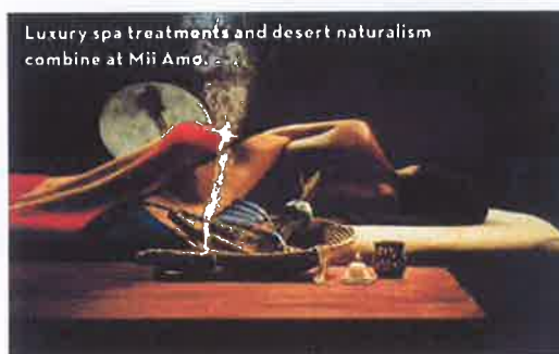
Luxury spa treatments and desert naturalism combine at Mii Amo.