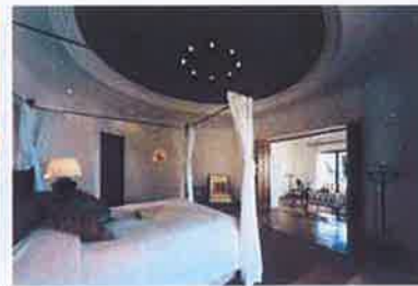
The accommodations, as well as the the spa, at Maroma are the height of luxury.